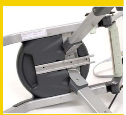
The Product Information Label can be found on the underside of the Stroller.